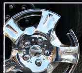
Cosmetic Damage to Hubcaps