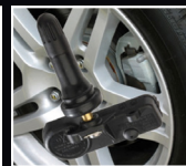
Tire Pressure Monitoring Sensors