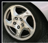
Cosmetic Damage Wheel Replacement