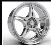
Cosmetic Damage to Chrome/Chrome Clad