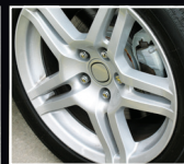
Aftermarket Wheels with no Surcharges